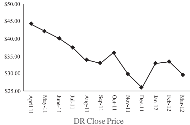
RIL GDR Price Movement over last 1 year

Source : Bank of New York Mellon website