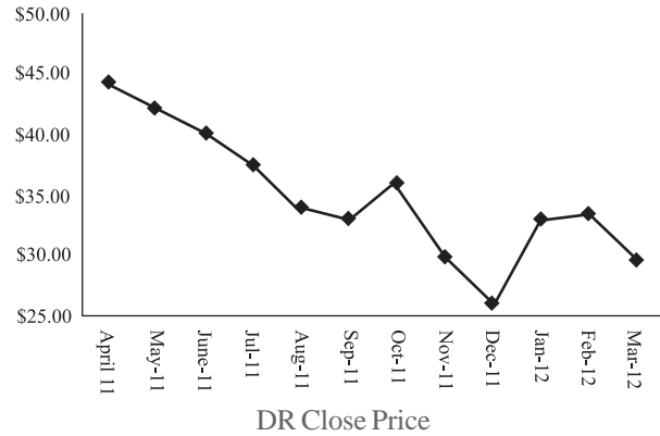
RIL GDR Price Movement over last 1 year

Source : Bank of New York Mellon website