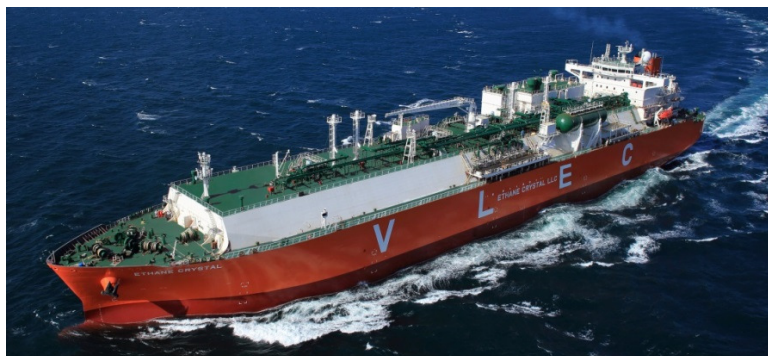
Very Large Ethane Carrier the ETHANE CRYSTAL

MOL utilized its experience, know how, and network built over the years as one of the largest LNG carrier owners and operators and, significant experience as owners and operators of LPG carriers in order to obtain this business. MOL's experience in LNG / LPG segments and its unmatched service, safety, reliability and efficiency precisely met the stringent requirements of Reliance prior being appointed as a suitable shipping partner for Ethane Transportation Project.